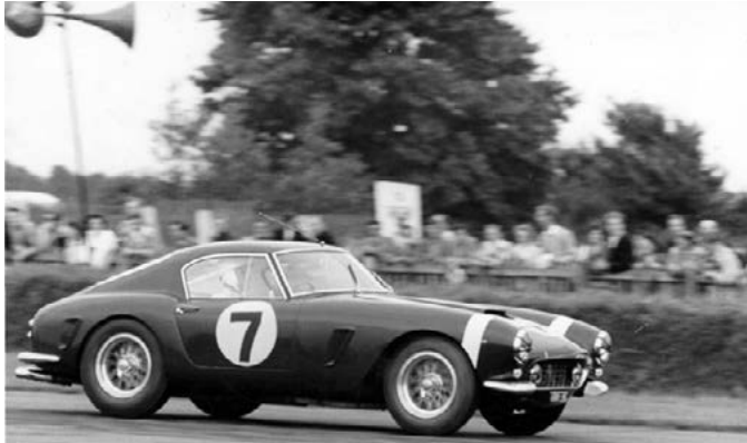
S/N 2119 - 250 GT SWB Berlinetta Alloy