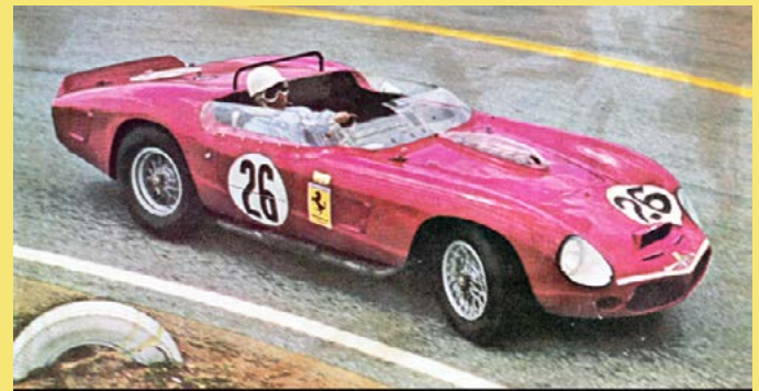
S/N 0794 - 250 TESTA ROSSA (TRI 61)

He entered a total of 529 races and won 212 of those. His first win was on April 7, 1948, in a Cooper JAP 500cc at the Brough Aerodrome in England. His last win was on Feb. 4, 1962, a 100-mile event at Watkins Farm in a Cooper-Climax 2700cc.