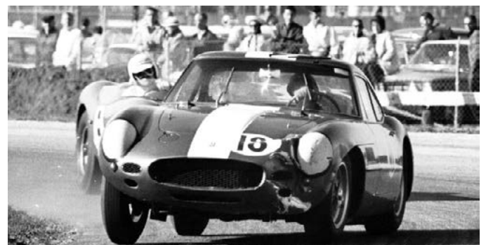
S/N 2643 - 250 GT SWB Berlinetta 61/Comp Pininfarina Speciale (Photo taken in 1962)

During the 1961 Le Mans, while driving S/N 2735, another 250 GT SWB, with Graham Hill, the pair were leading the GT group by miles when the car lost all of its water in the 10th hour because NART had forgotten to remove its road-going fan, and one of the blades broke off and slashed a radiator hose. It would be the last time Moss would drive in the endurance race.