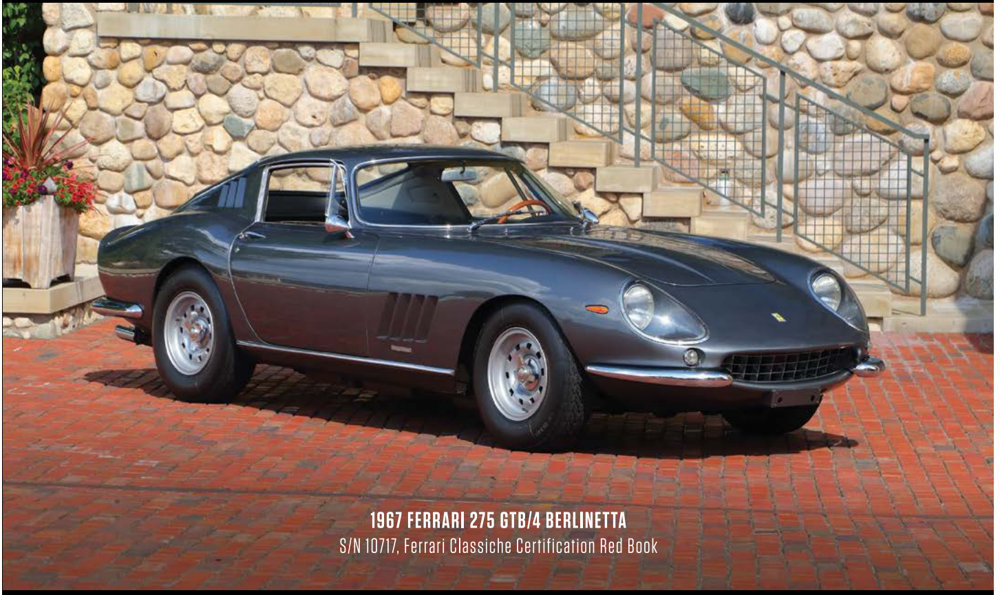
1967 FERRARI 275 GTB/4 BERLINETTA S/N 10717, Ferrari Classiche Certification Red Book

INDIANA STATE FAIRGROUNDS • INDIANAPOLIS, IN • 2,000 VEHICLES