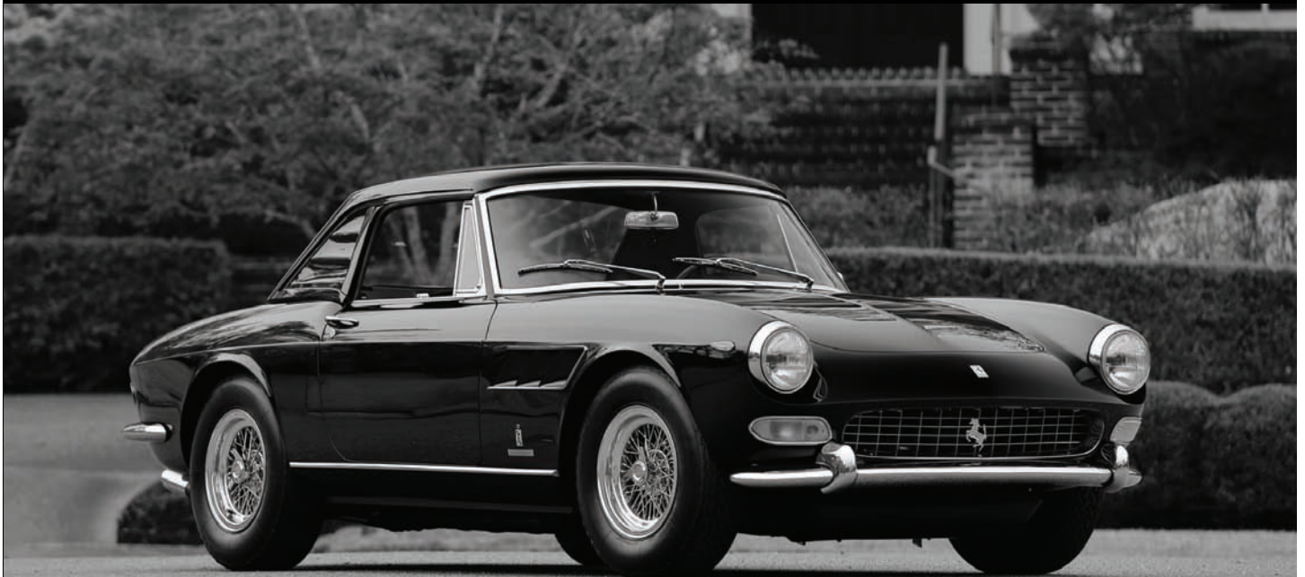
1965 FERRARI 275 GTS S/N 07427, Previously Owned by David Letterman

INDIANA STATE FAIRGROUNDS • INDIANAPOLIS, IN • 2,500 VEHICLES