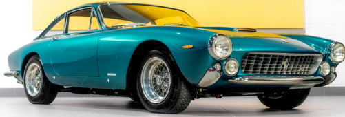
1963 FERRARI 250GT LUSSO - #5117 30,278 KMS (18,813 MILES)

175TH OF 351 BUILT - PINO VERDE ON TOBACCO CLASSICHE RED BOOK. PLATINUM AWARD WINNER FCA. EXTENSIVE DOCUMENTATION. OWNED AT ONE POINT BY REGGIE JACKSON.