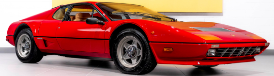
1984 FERRARI 512 BBI 15,856 MILES

175TH OF 351 BUILT - PINO VERDE ON TOBACCO CLASSICHE RED BOOK. PLATINUM AWARD WINNER FCA. EXTENSIVE DOCUMENTATION. OWNED AT ONE POINT BY REGGIE JACKSON.