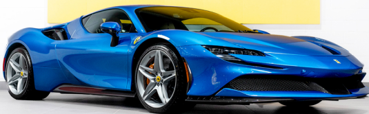
2022 FERRARI SF90 STRADALE 564 KMS (350 MILES)

ROSSO CORSA ON BEIGE, MAJOR ENGINE OUT SERVICE PERFORMED IN 2021 AT 15,779 MILES AND IN 2015 AT 9,575 MILES