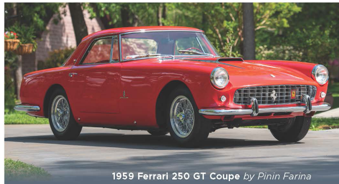
1959 Ferrari 250 GT Coupe by Pinin Farina