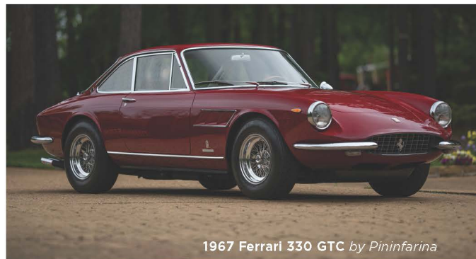
1967 Ferrari 330 GTC by Pininfarina