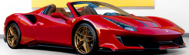
2019 FERRARI 488 PISTA SPIDER $719,995 USD 4,001 KMS (2,500 MILES)

BLU MONTREAL ON CARMINIO LEATHER BY POLTRONA FRAU, TAILOR MADE SPECIFICATIONS WITH PLAQUE 'WHAT'S BEHIND YOU DOESN'T MATTER' & SIGNED BY FERRARI FACTORY TEAM ON ENGINE COVER