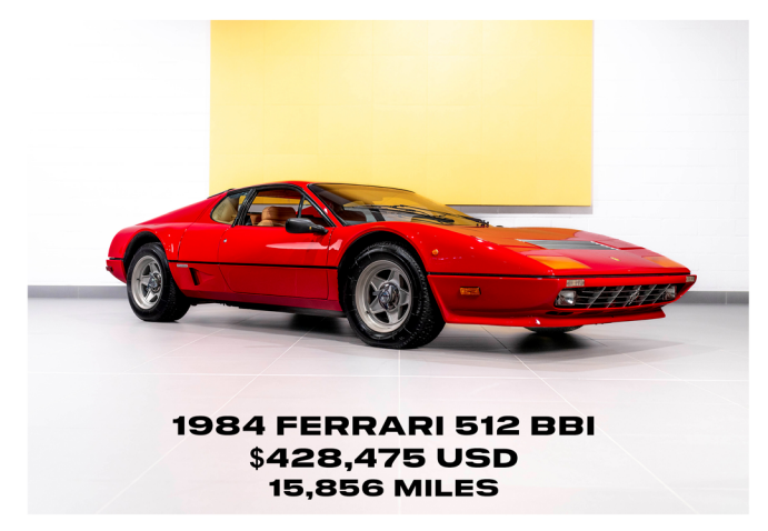
ROSSO CORSA ON BEIGE, MAJOR ENGINE OUT SERVICE PERFORMED IN 2021 AT 15,779 MILES AND IN 2015 AT 9,575 MILES

175TH OF 351 BUILT - PINO VERDE ON TOBACCO CLASSICHE RED BOOK. PLATINUM AWARD WINNER FCA. EXTENSIVE DOCUMENTATION. OWNED AT ONE POINT BY REGGIE JACKSON.