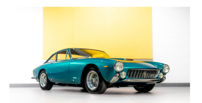
1963 FERRARI 250GT LUSSO - #5117 $1,799,995 USD 30,278 KMS (18,813 MILES)

175TH OF 351 BUILT - PINO VERDE ON TOBACCO CLASSICHE RED BOOK. PLATINUM AWARD WINNER FCA. EXTENSIVE DOCUMENTATION. OWNED AT ONE POINT BY REGGIE JACKSON.